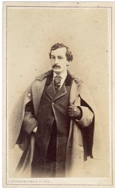
John Wilkes Booth, Carte de Visite taken by Charles D. Fredricks New York (1863) Library of Congress.