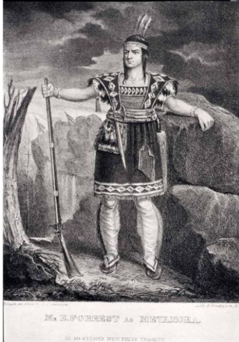
ABOVE - Edwin Forrest early in his career, costumed for his signature role as Metamora