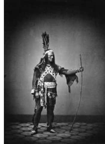
ABOVE - Mathew Brady Studio, Edwin Forrest as Metamora Modern salted paper print from original collodion negative, circa 1860