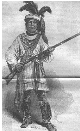
Billy Bowlegs, 1858

Perhaps another reason for him to have his picture take in the role is that it reminded him of another Indian that had figured in his early childhood, legendary Seminole Chief "Billy Bow Legs," 19 whose identity he had adopted as his youthful alter ego, 1 using that name as late as age 16 to sign his letters. 20